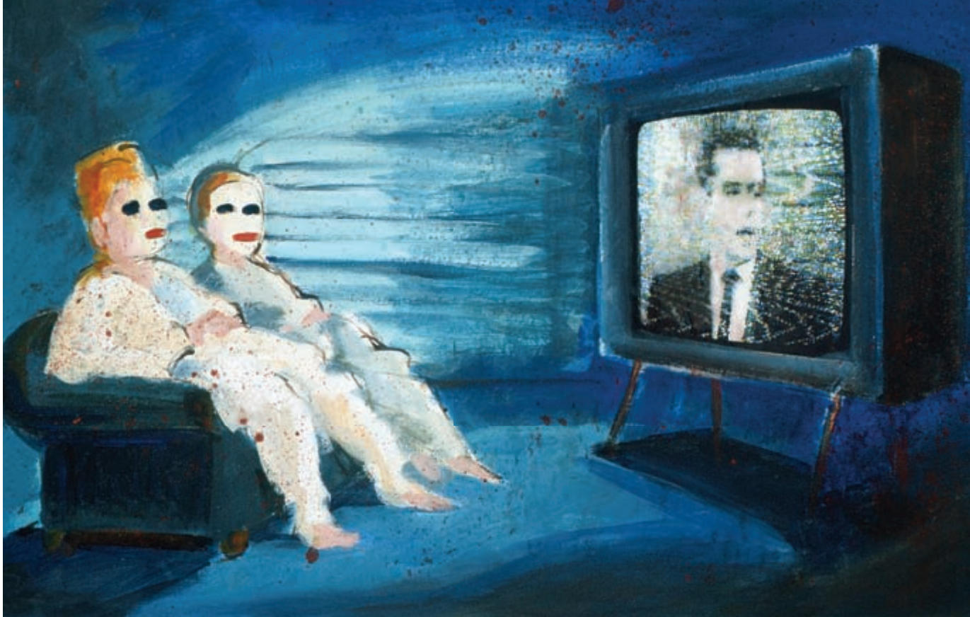
TVTime 2 (2002), Charles Foster-Hall. Acrylic on canvas, 16" × 28", 41 cm × 72 cm. © Charles Foster-Hall.

110 picture showed the full length of Harrison against a background calibrated in feet and inches. He was exactly seven feet tall.